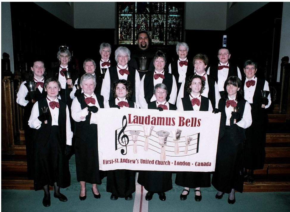
Laudamus Bells 2006

Laudamus Bells is an active and caring group of ringers with close friendships who enthusiastically welcome new members. Handbell ringing is a lovely way to make music and a sound that is heavenly and makes a beautiful addition to any service of worship. It is the ultimate in teamwork with all ringers having equal importance. Handbell music will ring out at First-St. Andrew's for many years to come.