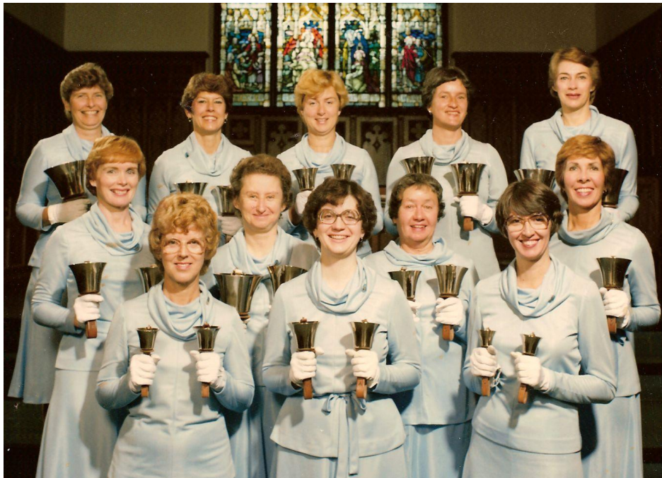
Ladies' Handbell Choir early 1980's