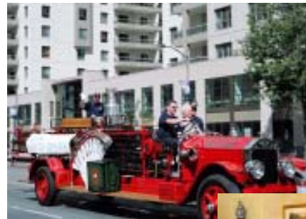
(Left) August 4, 2005, started with Ray riding an antique fire truck down Dundas Street with the Stanley Cup perched behind him. He took part in a photo session at Western Fair during the morning.

Ray is the third oldest Stanley Cup winning alumnus. The NHL decided to honour 40 of its alumni by letting them have the cup for a day... just as the players on a winning team are able to do now.