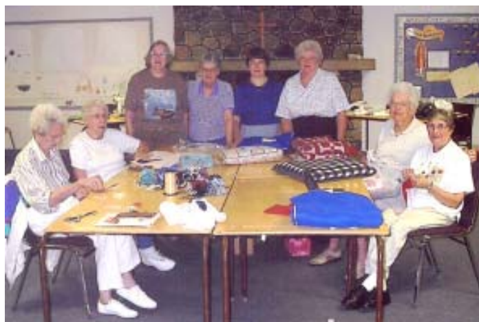
Above: Some of the members of the Sewing Group on a Wednesday morning.

Meets Wednesday from 9:30am - 2pm. Everyone interested in hand and machine sewing, cutting and stuff is welcome. Coffee is provided. Bring a lunch. The group prepares items for sale at the annual Bazaar in the fall.