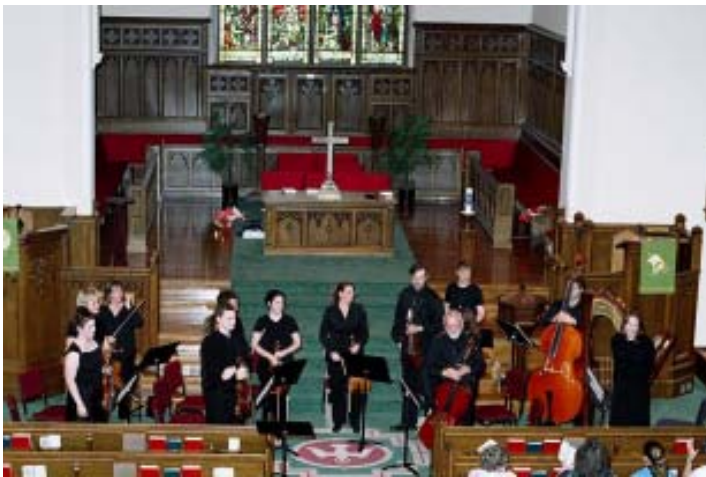
The FSA Strings get a standing ovation following a special concert in the Sanctuary in June