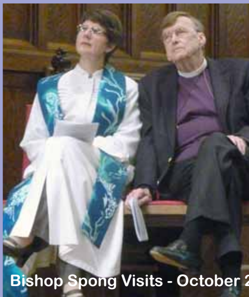
Bishop Spong Visits - October 23 rd