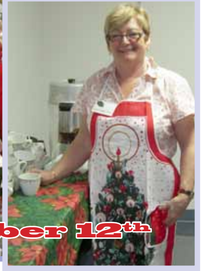
Holly Bazaar - November 12 th