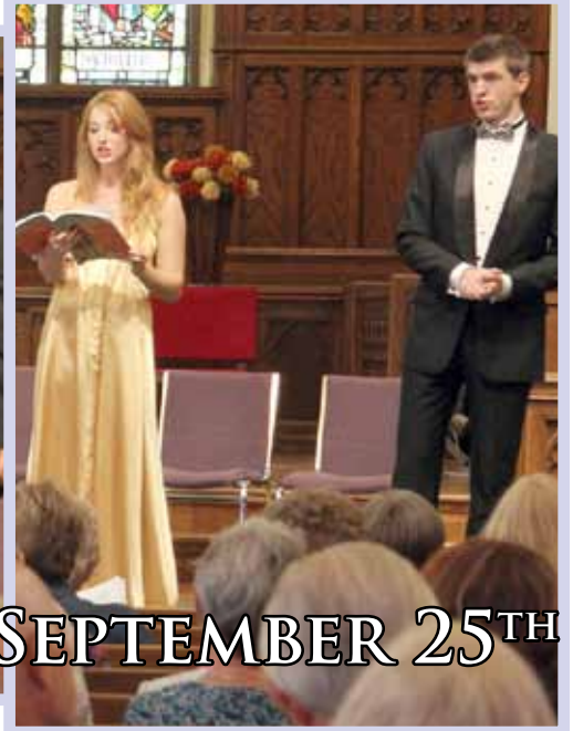
THE PIRATES OF PENZANCE - SEPTEMBER 25 TH