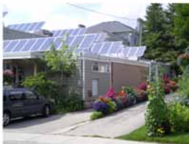
10 kW solar photovoltaic system at the Gentle Rain Organic Food store in Stratford, ON