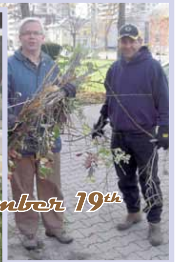
Fall Cleanup - November 19 th