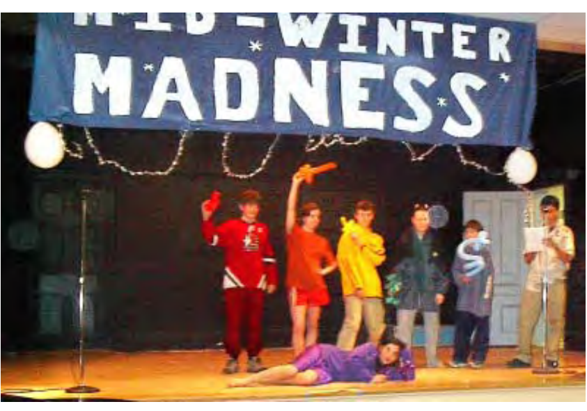
Members of the Youth Group perform in an M&S Fund "Fashion Show" to kick off Mid-Winter Madness.

The FSA Youth Council is now turning its attention towards planning our service in May. We will also, as always, be planning many fun and helpful events throughout the church and the community. We continue to encourage new members to join us, as well as friends from outside the church. We can learn so much more when we share varied beliefs and experiences, and, quite simply, the more the merrier!