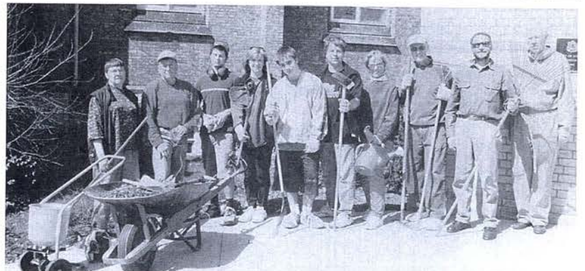
(Above) The Yard Cleanup Crew pose after a busy morning of making the church exterior look well-groomed.