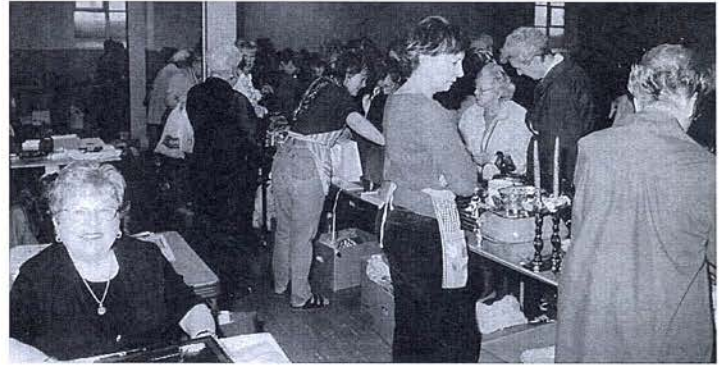
A View from behind the “Treasures” table