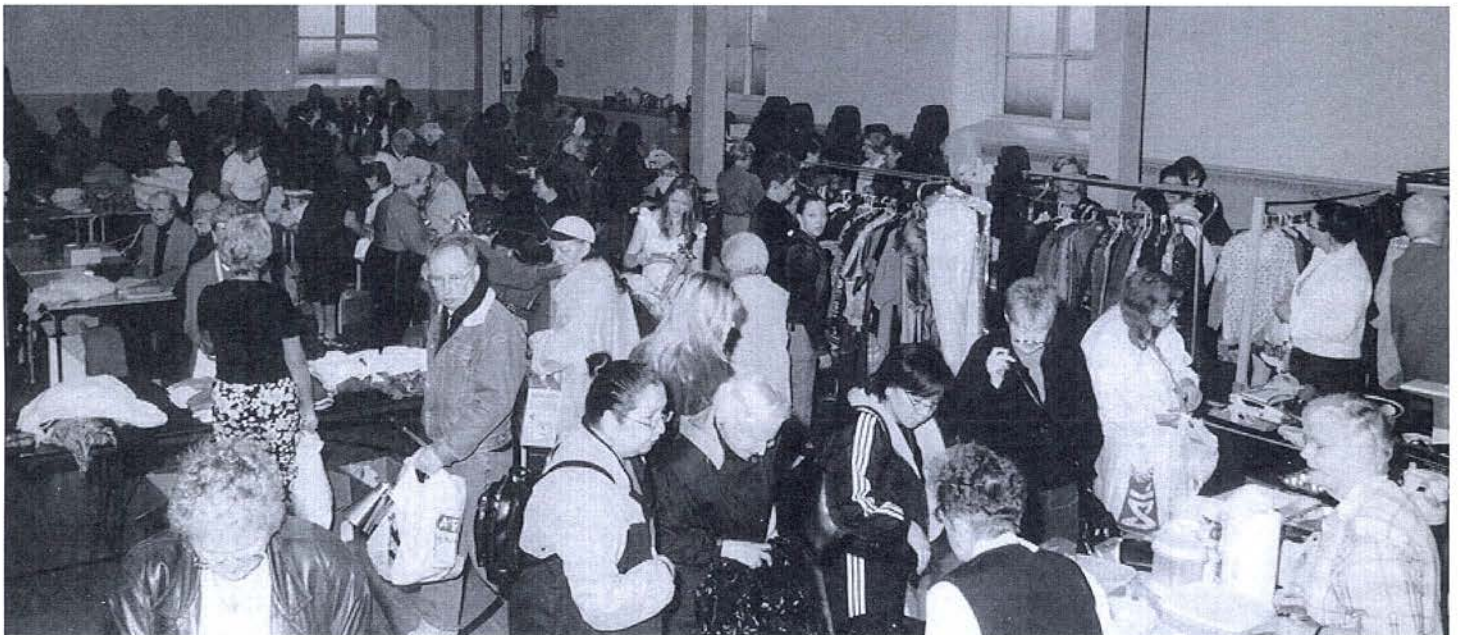
Another successful Rummage Sale! Thanks to those people who contributed items for the sale, to the volunteers who set up and priced the items and then sold them, and to the people who purchased something. The Sale is organized by the UCW, but the volunteers are drawn from a wide spectrum of members at FSA. The Rummage Sales generally raise about $2500 for the Outreach work sponsored by the UCW and FSA.