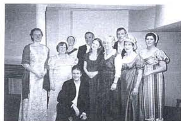
Left: The cast of the Jane Austen Society, London Chapter, which meets at FSA, preparing for a presentation of dramatic readings from "Pride and Prejudice" The group had a large turnout and has repeated the production at a Bi-Focal's Meeting.