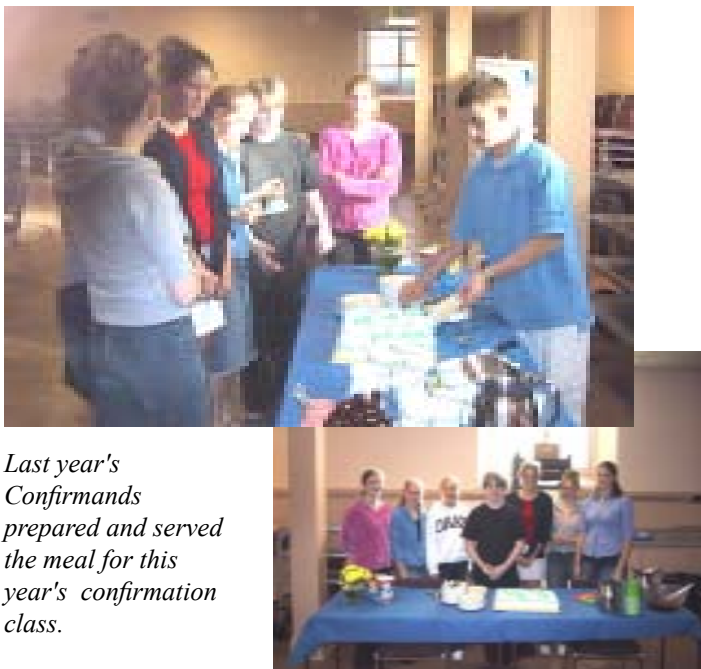
Last year's Confirmands prepared and served the meal for this year's confirmation class.