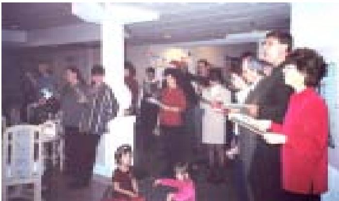
The Circle of Friends: Christmas Carolling

Please keep in mind the Community Outreach Committee's food collection for St. Paul's DAILY BREAD. Baby food is also a special need and may be left at any time. Baskets are placed at the entrance of the Chapel, and Narthex and Atrium entrances of the Sanctuary where you may leave your donations. Financial contributions are also welcome. Thank you for helping others!