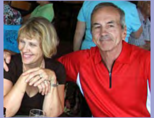
WHITE SQUIRREL "GOLF PROS"