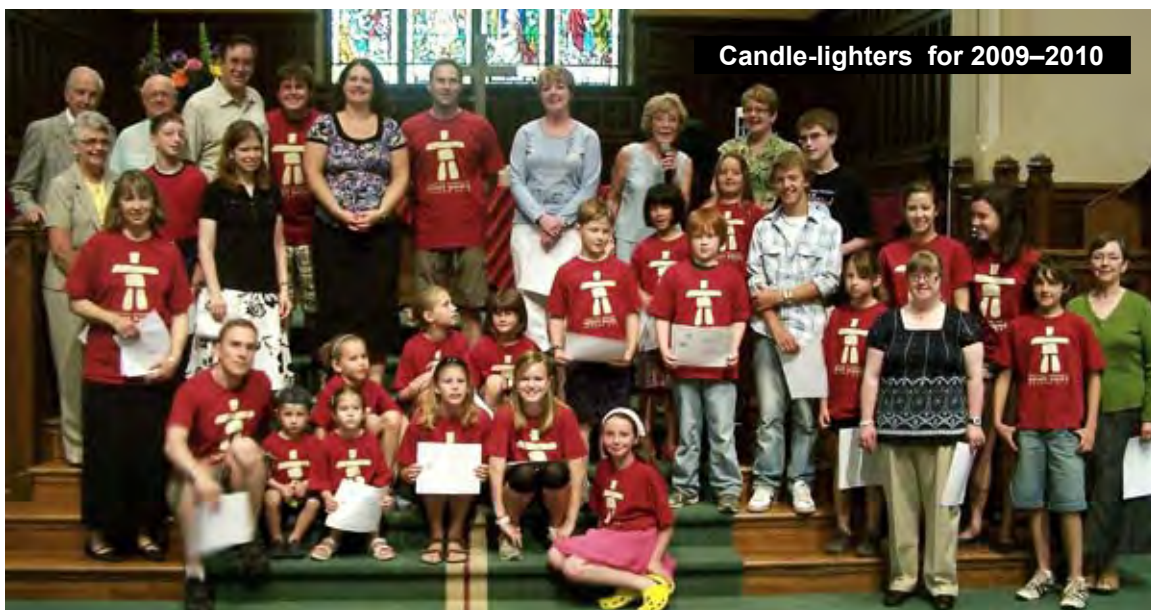
Candle-lighters for 2009-2010