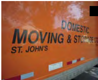
Kate's Moving Day